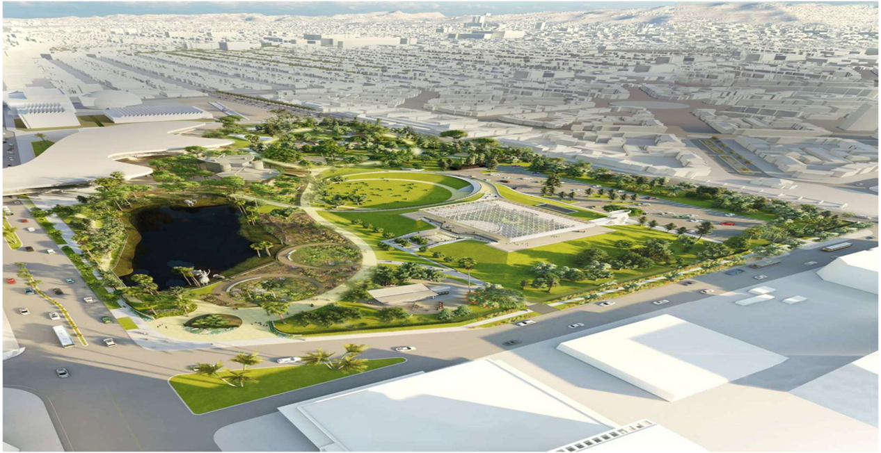
Rendering of the La Brea Tar Pits